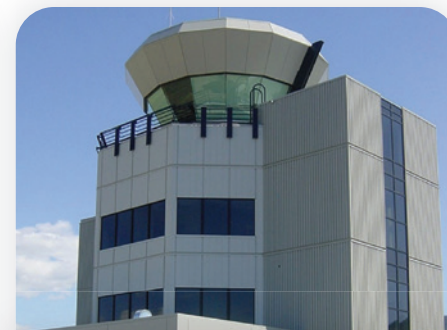
Government & Institutional