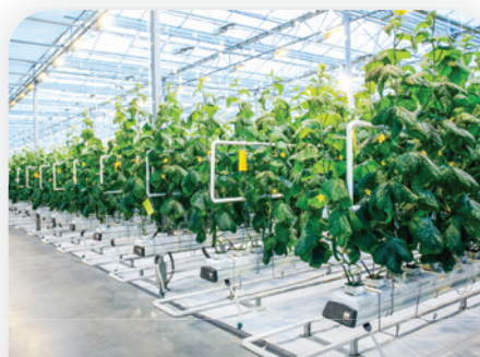
Indoor Growing Facilities