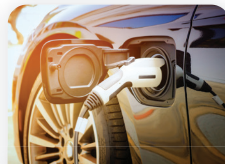
Electric Vehicle Charging